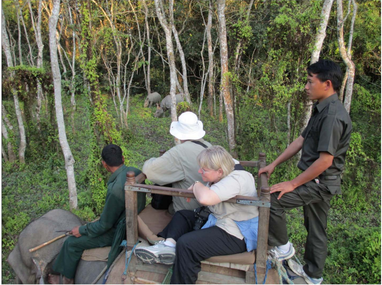
Elephant safari in Chitwan National Park, Chitwan