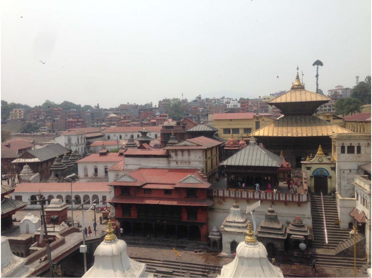
Pashupatinath temple, Kathmandu

Boudhanath : It is one of the largest stupa in the world. Believe to built around 5 th century. Approx 2kms away to the north from Pashupatinath temple (7 kms from city). The stupa is a popular site for followers of Buddhism and to the locals of Nepal. Pilgrims can be seen throughout the day circumambulating the structure (Note : Walk around in direction of clockwise of stupa).