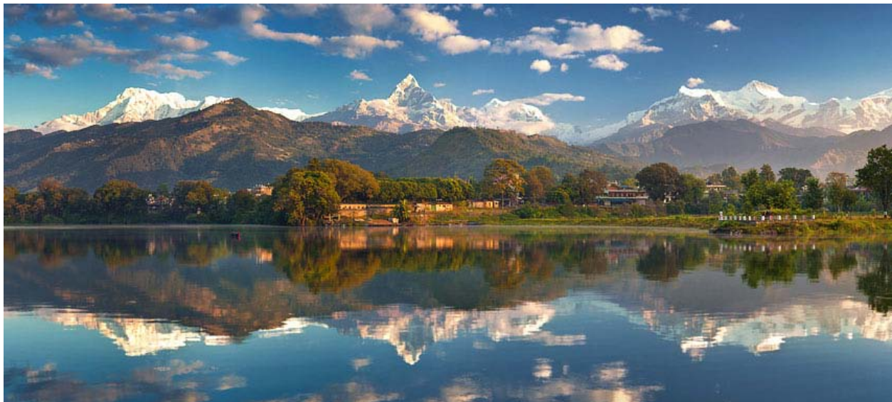
Phewa lake and mountain range in Pokhara