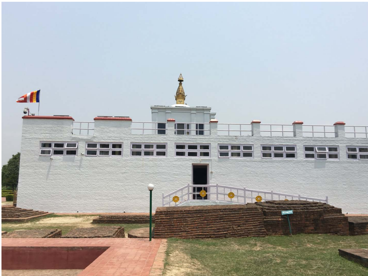
Mayadevi temple, Lumbini